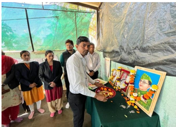
Netaji Subhash Chandra Bose Jayanti celebration