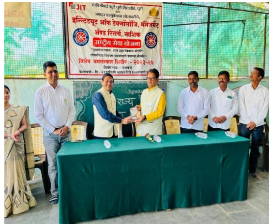
Felicitation of Chief Guest