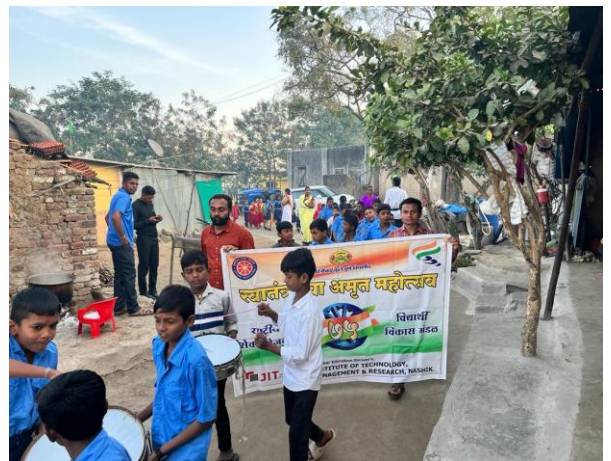
Republic day celebration