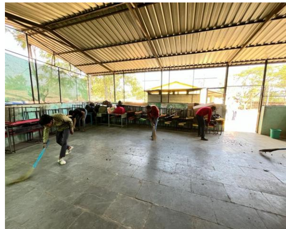
Cleaning Staying Location for Volunteers