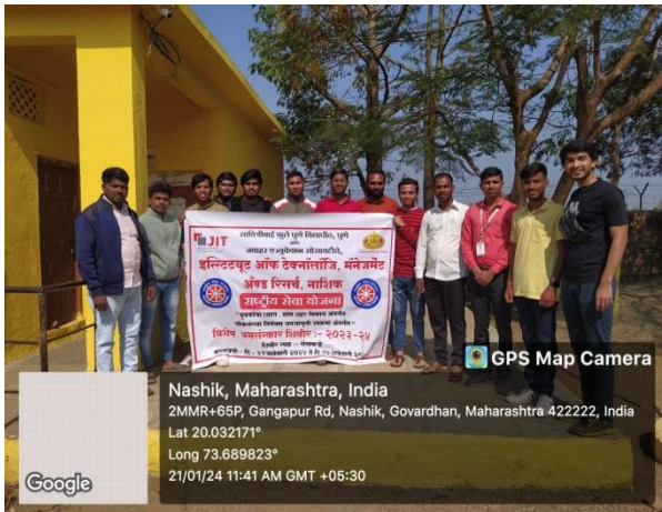
First Day Photo With Village Sarpanch.