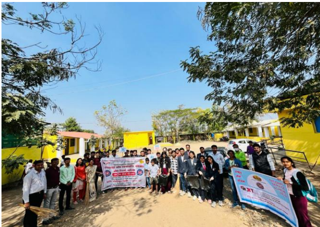
Gram Swachhata Abhiyan